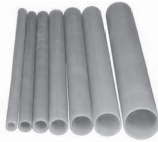
FRP Hand Lay-Up Pipe

All FRP (Piping Systems) are custom fabricated to order based on chemical service, pressure/vacuum and mechanical conditions.