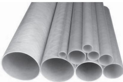
FRP Filament Wound Pipe